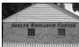
Seelye Research Center