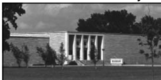
Eisenhower Presidential Library & Museum