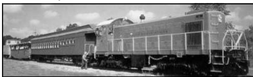
Abilene & Smoky Valley Railroad