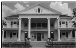
Historic Seelye Mansion

The reunion will feature the informative sessions you've come to expect, plus a chance to visit with family, as well as experience Abilene, Kansas and the remarkable history of the Great Plains!