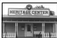
Dickinson County Historical Society Heritage Center