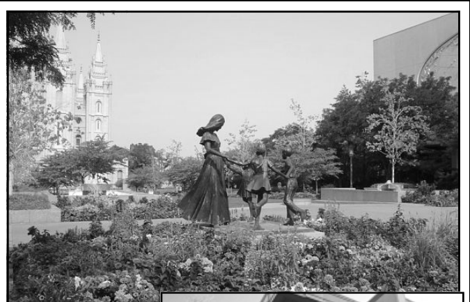
Among the things and places to see in Salt Lake City, are Temple Square (above), Utah's most popular attraction, as well as the Family History Library (right), the largest genealogical repository in the world, with millions of records.

No matter where you are, you can get here from there – and we certainly hope you do.