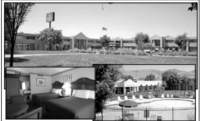
The 2009 SGS International Reunion will be held at Salt Lake City's Quality Inn Airport.

"We've enjoyed the experience of visiting different parts of the United States and once even traveled to St.