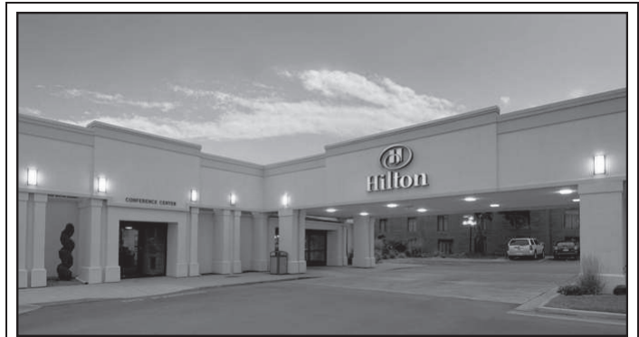
Site of the 2013 SGS International Reunion, the Hilton Grand Rapids Airport, 4747 28th Street SE, Grand Rapids, Michigan, 49512-1915

What is the lab looking for? In the DNA double helix, every one of the 3 billion nucleotides is built from some combination of four amino acids (A, G, T, C). As the DNA is copied for generation after generation, sometimes a